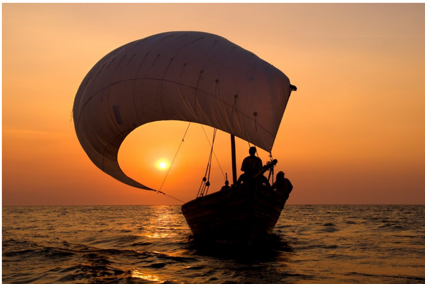
Sunset on the dhow

Namibia is a fascinating country where large spaces leave you speechless and where the sense of freedom is contagious; the immensity of the Namib Desert, the animals and safaris in the Etosha National Park, the majesty of the Fish River Canyon are the highlights of this trip.