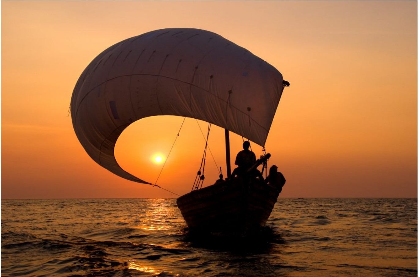
Sunset on the dhow

Namibia is a fascinating country where large spaces leave you speechless and where the sense of freedom is contagious; the immensity of the Namib Desert, the animals and safaris in the Etosha National Park, the majesty of the Fish River Canyon are the highlights of this trip.